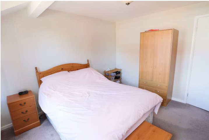
Bedroom Two 11' 9" (3.58m) x 7' 6" (2.29m)