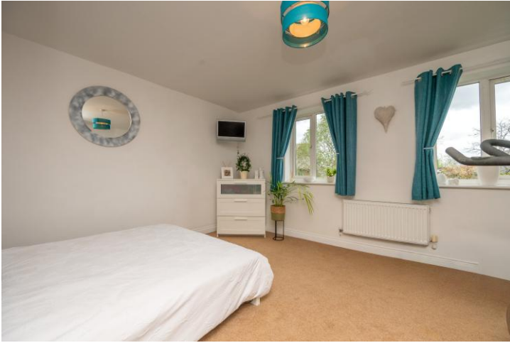
Bedroom Two (First Floor)