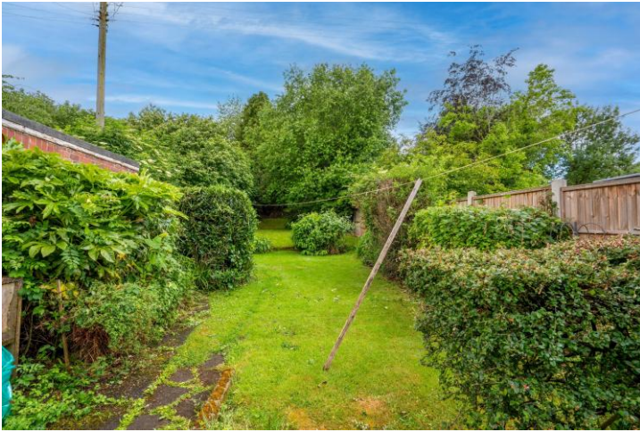
Mature Rear Garden